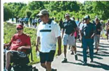
Crooked Branch Greenway Opening