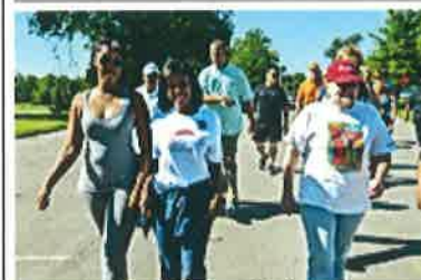
Jefferson Street History Walk